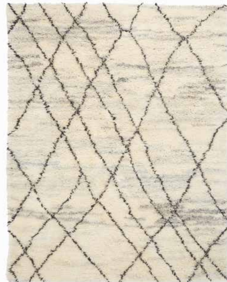
CK773 IVORY MULTICOLOR